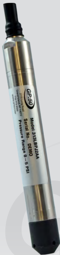
Model 313L Submersible Level Transmitter