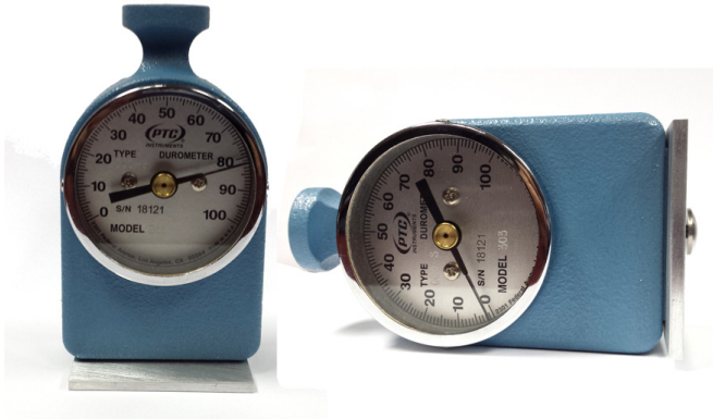
Model 303 ASTM Type Shore 000-S

PTC®'s Model 303 ASTM Type 000-S Shore Durometer measures the hardness of viscoelastic polymers. Applications include motorcycle seats, medical pads and wheel chair cushions for pressure ulcer prevention. Equestrian pads, gun recoil pads and cool gel mattresses.