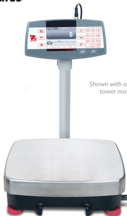
Shown with optional tower mount