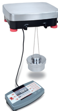
Weight below hook in use

Additionally, a weigh below hook offers the functionality to perform specific gravity tests or weigh items that cannot be easily placed on the weighing platform.