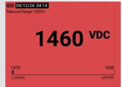
Limit gauge - outside of range