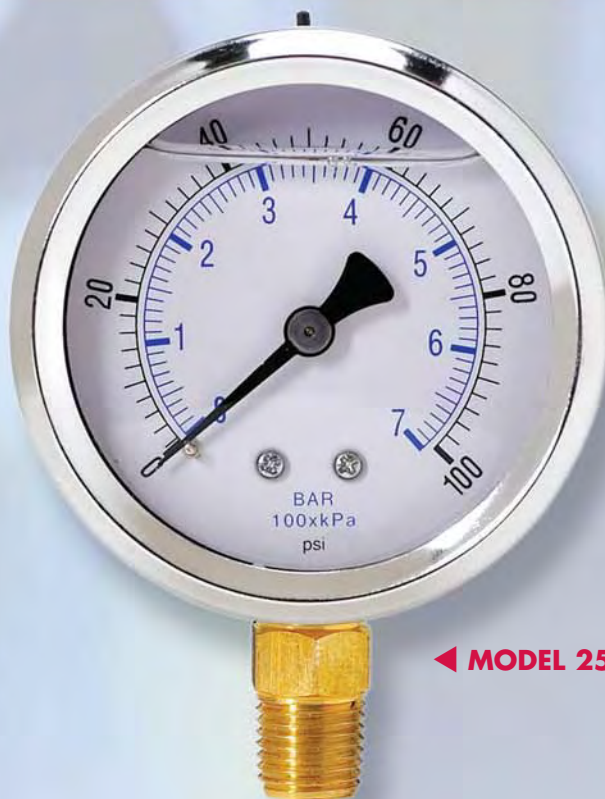
◀ MODEL 251L4