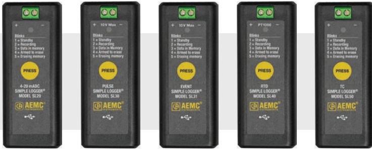
Model SL20 Model SL30 Model SL31 Model SL40 Model SL50

Models available for logging DC Current, Temperature, Pulse and Events