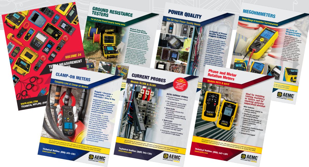
Family of Products

Engineered for Excellence BUILT TO LAST™