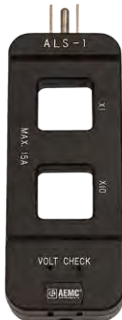
AC Line Splitter Model ALS-1 Cat. #2121.05