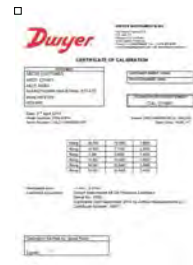
6-Point Calibration Certificate Included

The SERIES 2000-HA High Accuracy Magnehelic® Gage is twice as accurate as the standard Magnehelic® gage. The well-engineered High Accuracy Magnehelic® Gage offers a mirrored overlay as standard in order to eliminate any parallax error when taking measurements. A six point calibration certificate is included with each high accuracy model. The rugged IP67 casing helps fully protect against dust and water ingress. The redesigned corrosion resistant brushed 304 stainless steel bezel option offers a clean tapered design, yet minimizes the possibility of any dust accumulation on the edges.