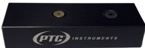
Aluminum Test Block

All durometers come complete with an aluminum test block and carrying case. The test blocks are color coded to match durometer type. The blocks will read within \pm 1 point of a properly functioning durometer.