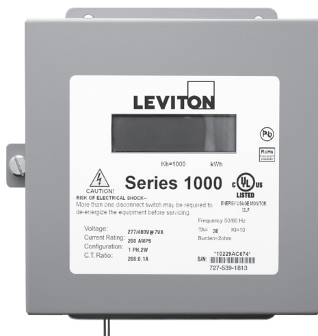
Indoor JIC Steel Enclosure