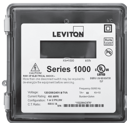
Outdoor NEMA 4X Enclosure