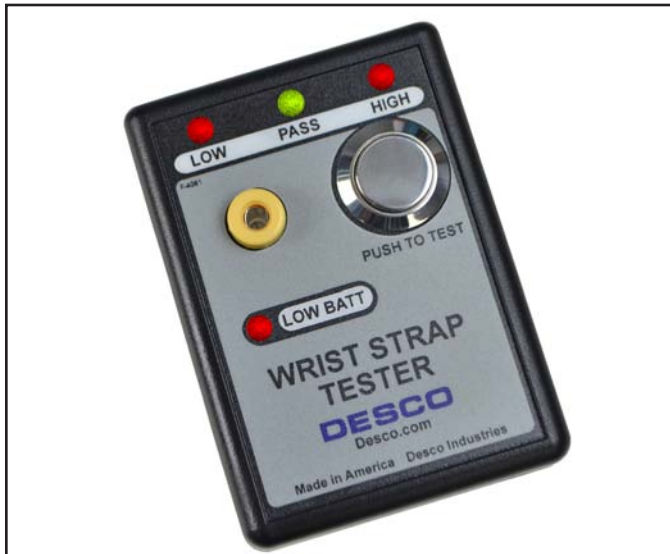
Figure 1. Desco 19240 Portable Wrist Strap Tester