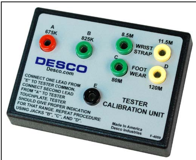
Figure 3. Desco 07010 Calibration Unit

View technical bulletin TB-2039 for more information.