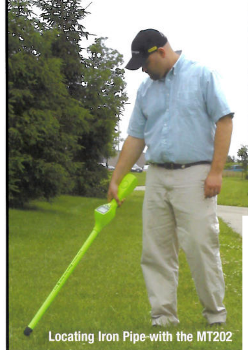
Locating Iron Pipe with the MT202

Locate ferrous objects under ground, under water, or in snow: