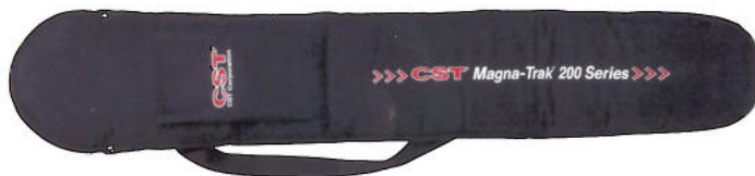
Soft Padded Cordura® Carrying Case

19-552 Soft Padded Case for Magna-Trak Locators, yellow 19-553 Hard Case for Magna-Trak Locators 19-559 Soft Padded Case for MT-102, chartreuse