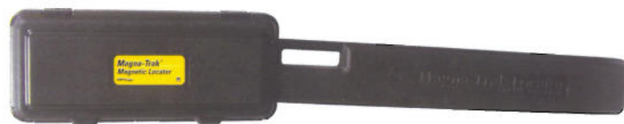
Hard Carrying Case