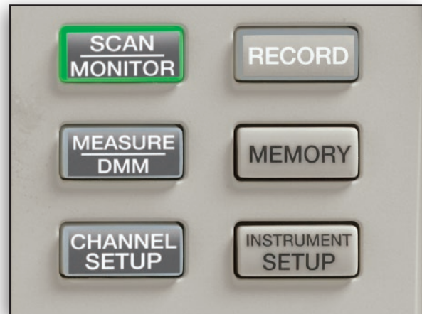
Scan, monitor, measure, and DMM function keys on the front panel.

Function keys are backlit so that you always know the mode of operation and recording status.