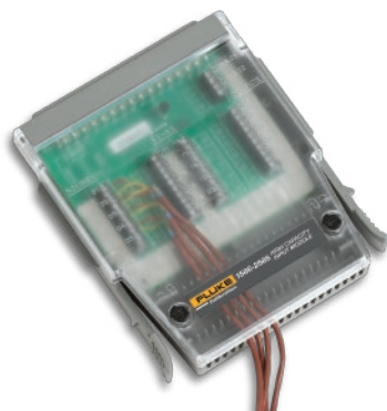
1586-2586 High-Capacity Module

For a calibration lab where accuracy is of primary importance, the Super-DAQ is best configured with a DAQ-STAQ Multiplexer. The external DAQ-STAQ features mini-jack thermocouple terminals—each with its own reference junction sensor—and patented mini-DWF, gold-plated input terminals, which accept bare wire, spade lug, or mini-banana-plug probe terminations. Easily connect and disconnect PRTs, thermistors, and thermocouples for benchtop temperature calibration. It can be stacked on the 1586A to reduce footprint in busy labs. Having the flexibility to configure the Super-DAQ for factory or lab use reduces your equipment needs and cost.