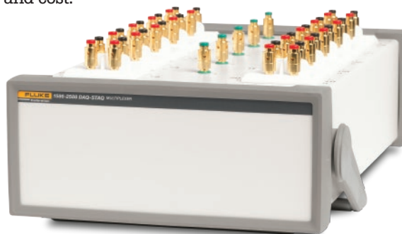
1586-2588 DAQ-STAQ Multiplexer

Universal input channels accepts 2-, 3-, or 4-wire connections to measure temperature, resistance, dc voltage, and dc current for