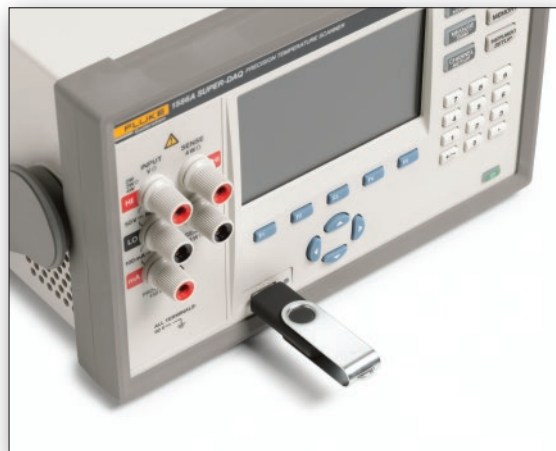
Easily transfer Super-DAQ data and setup files using a USB flash drive.

The Super-DAQ also includes two levels of data security to prevent unauthorized users from tampering with or forging test data or setup files. This security feature is especially important to industries that are regulated by government agencies where data traceability is required.