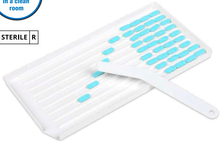
For capsules from size 2 to 00