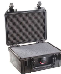
1150WF With Foam