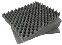
1151 3 pc. Replacement Foam Set