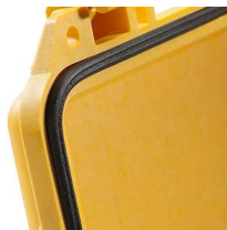
1153 Replacement O-ring