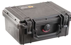
1150NF No Foam