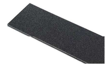
1150TPDIV Extra TrekPak Dividers