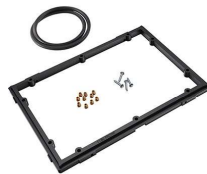
1150PF Special Application Panel Frame