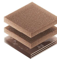
1500CI Corrosion Intercept