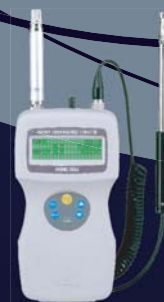
Instrument with Optional Air Velocity and Temperature/ Humidity Probes