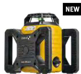
LAR 160 G