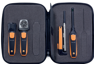
VAC Smart Probe Kit: 0563 0003